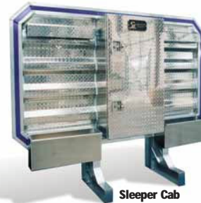
Sleeper Cab Style 6886-DH/CV Mini Vault • 2 LCR • 2 Half Trays 16" x 24" x 44" Mini Box Vault with 2 shelves

All Cab Racks are tested to a uniform static resistance. Sturdy-Lite makes no claims to impact resistance, neither stated nor implied, except for static resistance as stated on the Warning label.