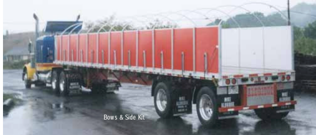
Bows & Side Kit

Bows 10', 18', 24', 28', 30', 32', & 36' Rise Available with PVC sleeve