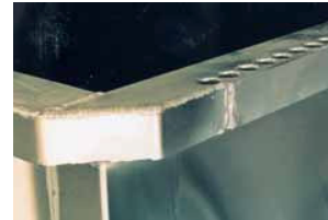
Bulkhead with 22" Wrap Allows for Bow and Side Kit Storage