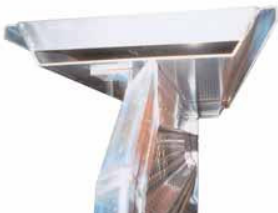
Top Mounted Tarp Tray