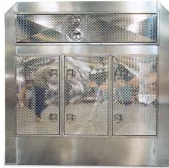
Sleeper Cab Style 8484VEC-14FE 4 Door Fully Enclosed 14" Vault