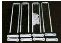
Style UK-20 U-Bolt Mounting Kit (Standard on most cab racks)