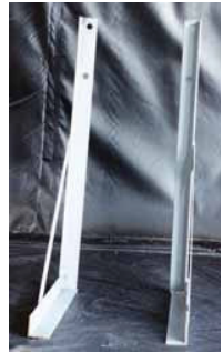
Steel Box Brackets MB-18: 17" x 17" MB-24T: 23" x 23" MB-24TR: 30" x 22"