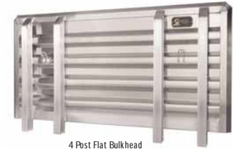
4 Post Flat Bulkhead DOT 50,000 lb. Load-Rated