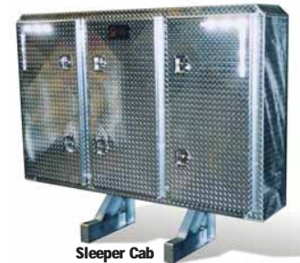
Sleeper Cab Style VEC-14 14" Vaulted Enclosure • 3-Door Compartments LCR left and right • 2 Center Shelves (Available in all-diamond, sm ooth-diamond, or all-sm ooth)

*Function: by their very nature Cab Racks cannot meet the requirements of CFR 393.114.a. All load securement should be per CFR 393.100 to 393.132.