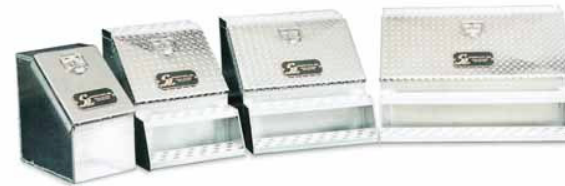
Saddle and Step Boxes 12", 18", 24", 30", and 36" Lengths Saddle Box 20" x 20" x Length Step Box (with steps) 21 1/2" x 30" x Length