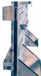
Optional Equipment Timber Package Tarp Shelves

Sturdy-Lite manufactures over 30 different variations of Cab Racks.