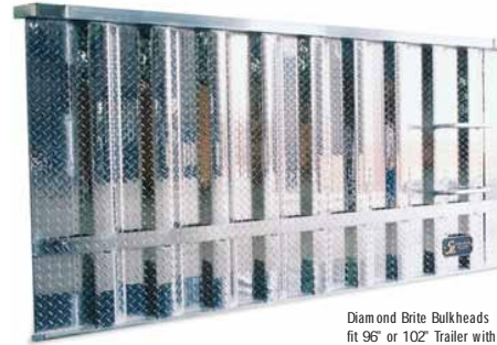
Diamond Brite Bulkheads fit 96" or 102" Trailer with a 9', 10', or 22" Wrap DOT 50,000 lb. Load-Rated