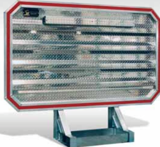
Sleeper Cab Style 6886-MD Modified Deluxe • Center Tray 48" LCR (Locking Chain Rack)