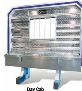
Day Cab Style 6872-P/BW/FTL Plain Cab Guard • Bar Window Full Tray with Lid