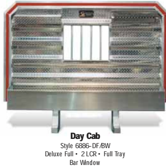
Day Cab Style 6886-DF/BW Deluxe Full • 2 LCR • Full Tray Bar Window