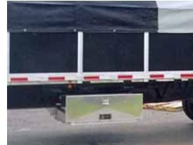
UBR-48 Underbody Storage Rack Lockable Anti-Theft Low Profile Clears Slide Track and Most Outriggers