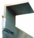
Load Light Bracket Standard on every Sturdy-Lite Cab Guard!