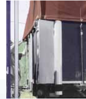
Breakdown Bulkheads with Special Built Corners

Bows 10', 18', 24', 28', 30', 32', & 36' Rise Available with PVC sleeve