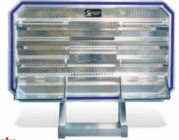
Sleeper Cab Style 6886-MD/TS Center Chain & Binder Hanger 2 Coil Rack Holders • 2 Tarp Shelves Timber Package - (Rear)