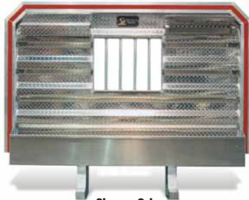
Sleeper Cab 6886-DF/BW Deluxe Full • 2 LCR • Full Tray • Bar Window