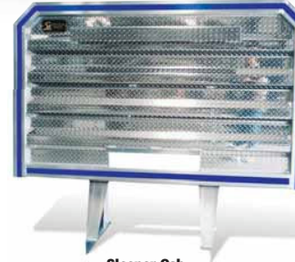
Sleeper Cab Style 6886-MDR/SF Modified Deluxe • Reverse Chain Tray Short Swing Clear Foot

Function, durability and visual appeal are assured by our rigid quality control standards.