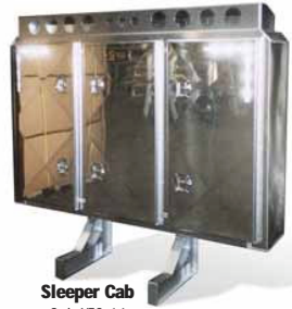
Sleeper Cab Style VEC-14 14" Vaulted Enclosure • 3-Door Compartments LCR left and right • 2 Center Shelves • Light Bar