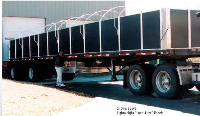
Shown above: Lightweight "Load-Liter" Panels (11 lbs. per panel) Tarp Caddies Breakdown Bulkhead

Triple hollow T stakes, 7/8" solid aluminum bows, lite weight Load-Liter, 1/2" & 5/8" fir plywood, fiberglass on plywood panels, 18oz. vinyl coated nylon fitted tarp, tarp caddies 96" or 102" trailer