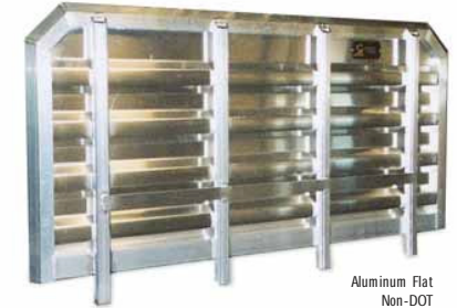
Aluminum Flat Non-DOT