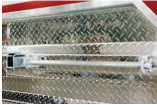
Coil Rack Holder Slide Bar with Lockable Design