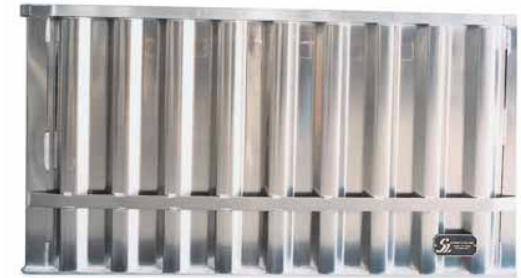
Smooth Aluminum Bulkhead 9', 10', or 22" Wrap DOT 50,000 lb. Load-Rated