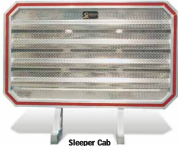
Sleeper Cab Style 6886-P Plain