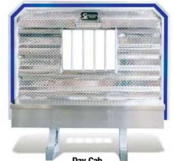
Day Cab Style 6872-DF/BW Plain • Bar Window • Full Tray

Sturdy-Lite Cab Racks are engineered from high strength premium aluminum alloy. Function, durability and visual appeal are insured by our quality control as well as our "Treadbrite" finish along with custom color detailing. (Over 25 detailing colors are available.)