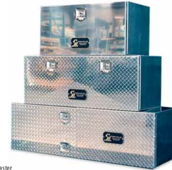
Roadmaster 18" x 18" x 24" (or) x 30" (or) x 36" with single Diamond Door or Mirror Door 18" x 18" x 48" (or) x 58" (or) x 60" with single or double Diamond or Mirror Door 18" x 24" x 48" (or) x 58" (or) x 60" with single or double Diamond or Mirror Door