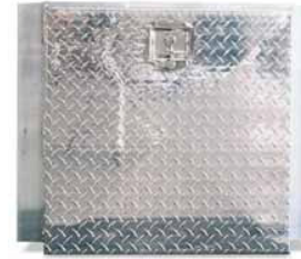
Between-Frame Toolbox 10" x 24" x 24"

All Toolboxes: All Aluminum including step material. Stainless Steel Hinge Stainless Steel Latch