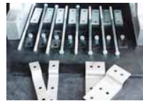
MK-19 or MK-22 Straight Bolt Mounting Kit SK-4 Side Mounting Kit