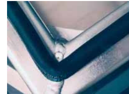
One-piece Solid Rain Gusset with Rubber Water Seals Reinforced Corners