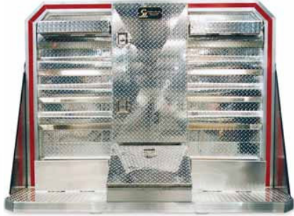
Sleeper Cab Style 6886-DH/CV/DLB Center Vaulted Enclosed Drom, LCR and Trays Vault • Drom Deck with Logger Box