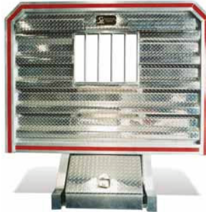
Day Cab Style 7378-P/BW (CH Mack) Plain Cab Guard • 2 LCR • Bar Window Logger box optional

Sturdy-Lite Cab Racks are manufactured from high-strength premium aluminum alloy.