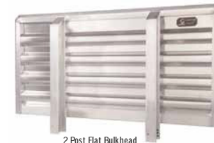
2 Post Flat Bulkhead DOT 60,000 lb. Load-Rated

are manufactured to highest quality level. They are engineered and independently tested to the requirements of D.O.T. 393.114 ¶ D*