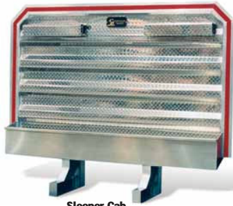
Sleeper Cab Style 6886-DF Deluxe Full • 2 LCR • Full Tray (also available with 2 half trays)